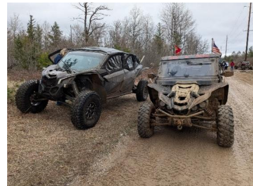
EXIT222 had a group ride with many starting from Frank Alley Park.