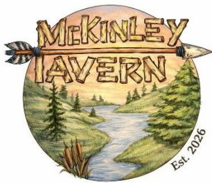
DJ's Scenic Bar in McKinley was sold and renamed McKinley Tavern.