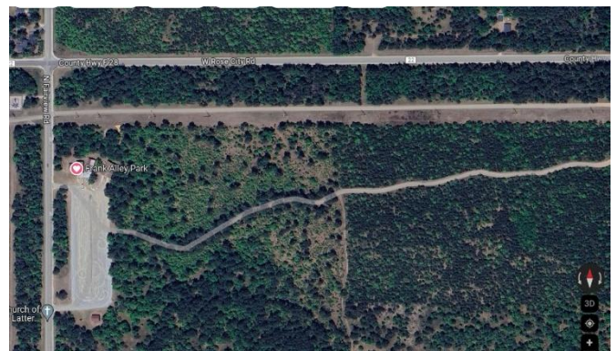
I found this satellite photo of Frank Alley Park taken a few years ago.