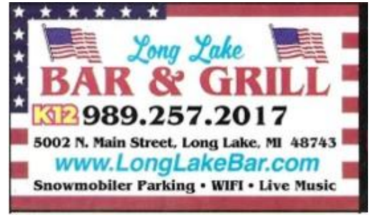
Walt captured the Long Lake Bar on fire March 16. It looks to be a total loss. The fire likely started in the kitchen area.