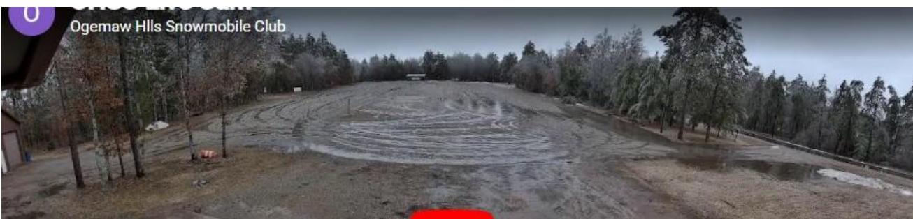
Ice coated trees at the end of March and again in the beginning of April. Damage estimates have not been determined.