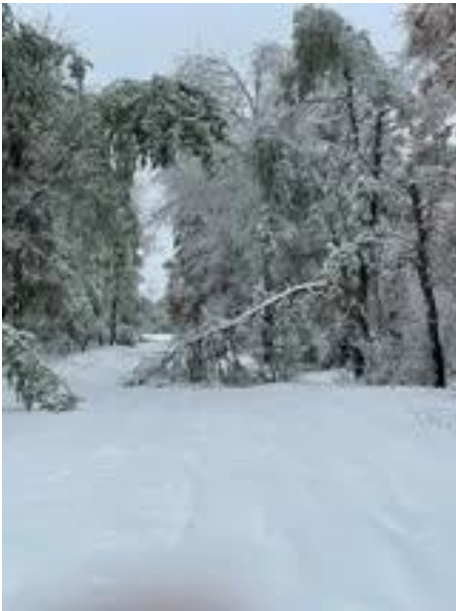
Phil Duby reported tree down on trail 6 / Perry Holt