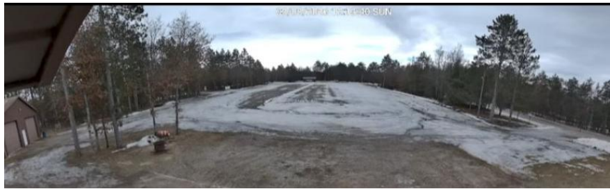
March 8, snow almost gone.