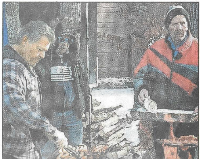
The crowd enjoyed over 800 fire-roasted rake dogs.