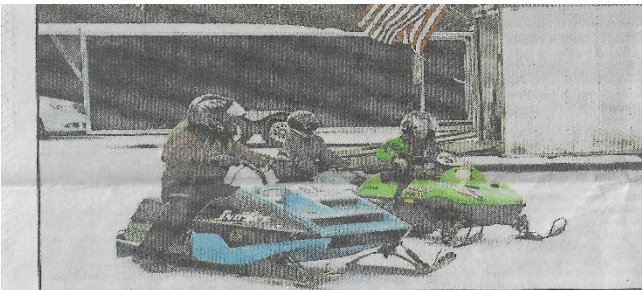
Youngsters zip around the parking lot on vintage snowmobiles.