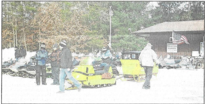
Ogemaw Hills Snowmobile Club hosted a Vintage Snowmobile Show Feb. 28 at the Frank Alley Trail head north of West Branch.

Thanks to all who came and enjoyed the show. Mark your calendars for the next Vintage Snowmobile Show & Open House Feb. 27, 2027.