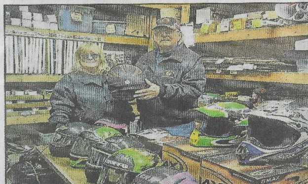
OHSC donated youth-size snowmobile helmets to The Top of the Lake Snowmobile Museum in Naubinway.