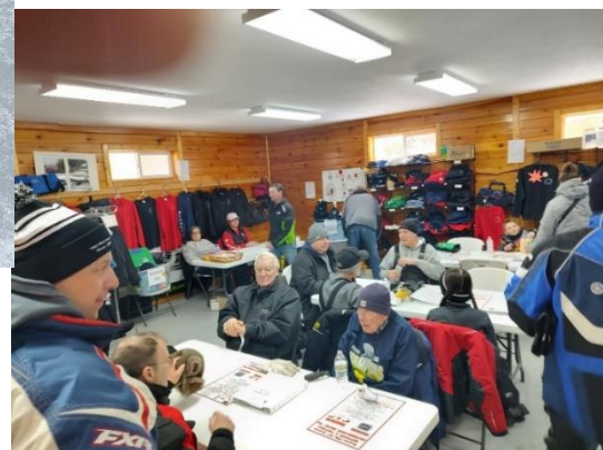
Several of the veterans gathered inside the clubhouse.