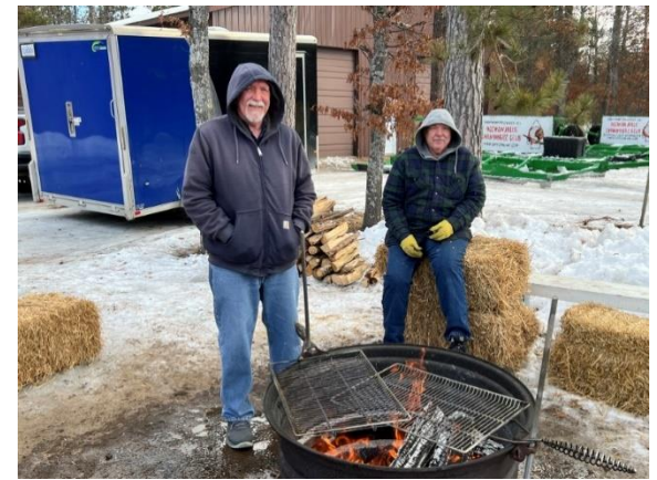
Someone was always around the firepit.