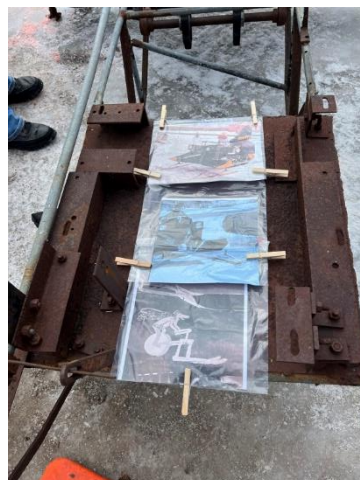
Someone brought the frame for a racing sled.