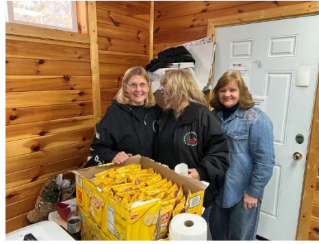
The food ladies.