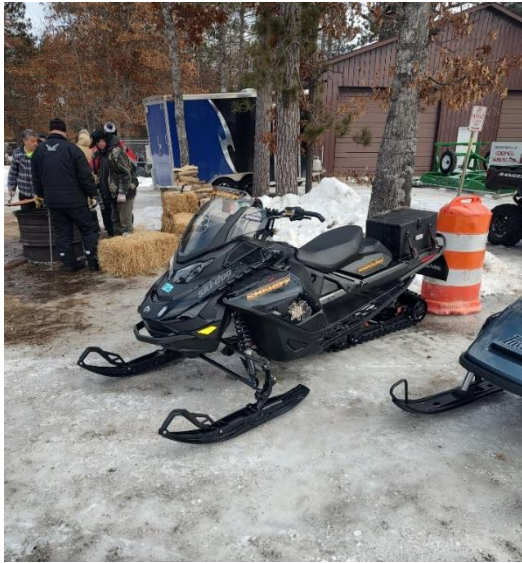
Several Ogemaw County Sheriff deputies attended the show. One of them even joined the Club. They also had a training session going on at the Rose City Rd. trail crossing.