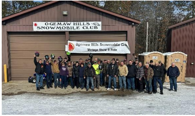
36 members showed up to help Friday.