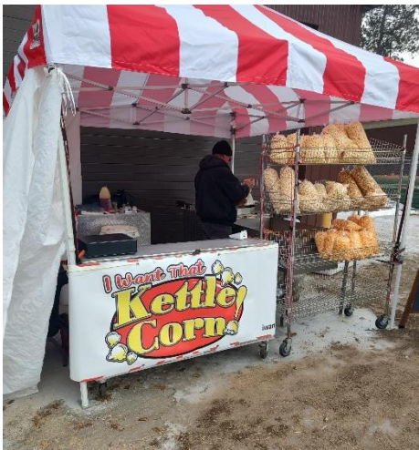
I want that Kettle Corn was here again.