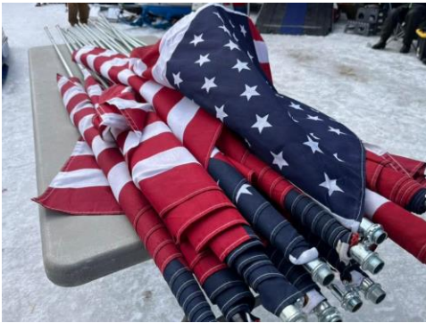
People unloaded the 50 flags the Blaine family brought for the show.