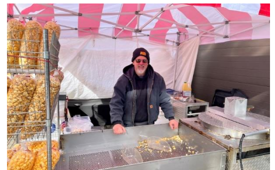
Kettle Corn guy.