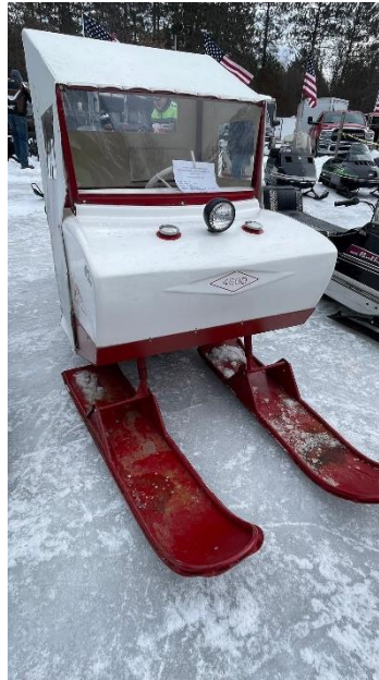
With or without a top?