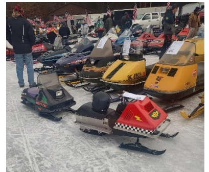
There were many mini sleds there this year. Kids were zooming around the parking lot all day.