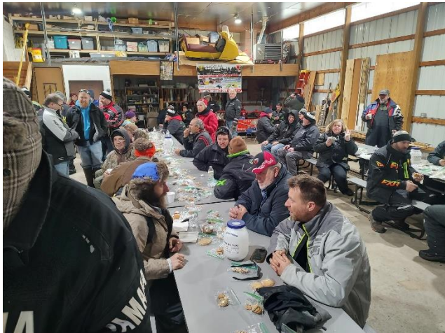
The Clubhouse barn was a popular spot to warm up and eat hot dogs.