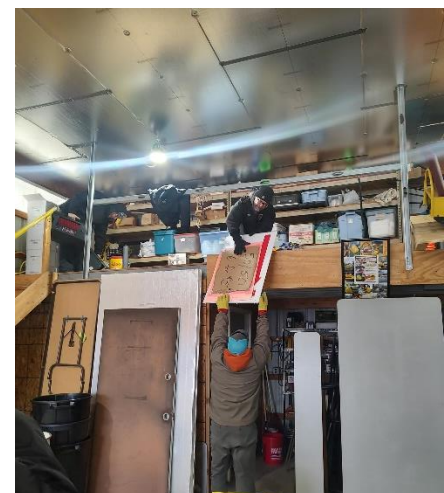
There was lots of signs and tubs to put back on the loft after the show.