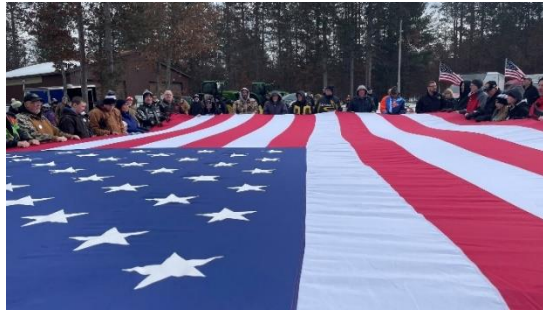
Large flag brought by the Blaine family.