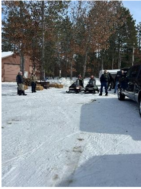
Two visitors from Indiana stopped by Friday while they were riding their vintage sleds.