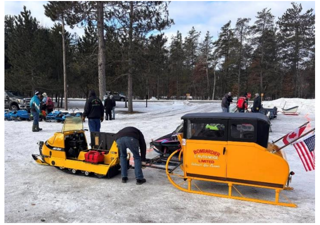
One of the interesting sleds