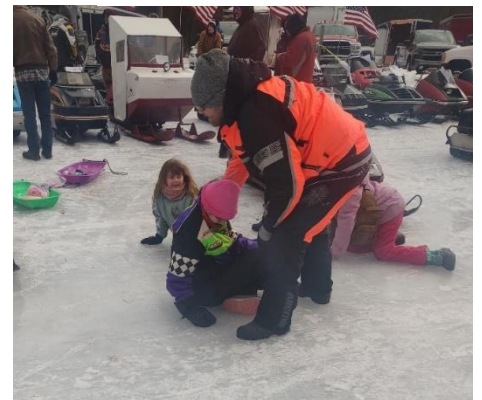
Kids found lots of ways to entertain themselves: spinning on the ice and climbing the snow mountain