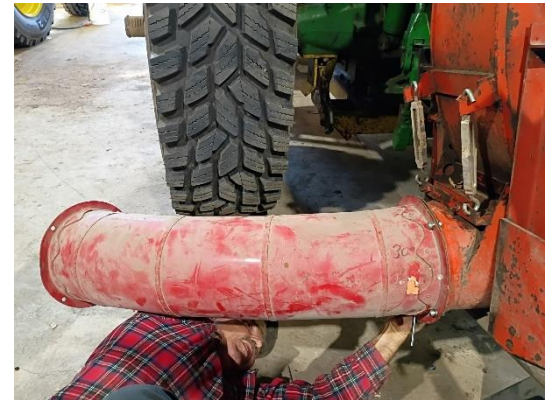
It is a big job getting the leaf blower hooked up to the 7410 so it can clear the leaves before we grade.