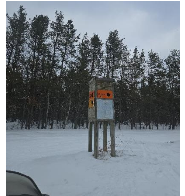
A group went the wrong way here. Wanted to go to South Branch on #6 ended up on 69.