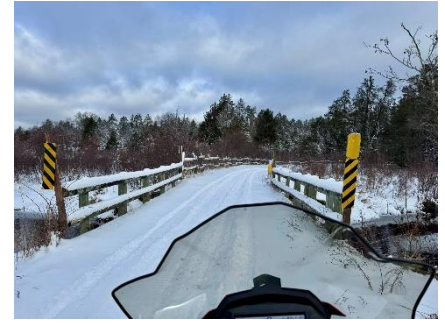
Dave Nowakowski ran 6 W from Tower rd. To 9 N to 96 E to 969 S back to W 6 down to Tower rd. 69 miles total. Snow was best east of 9 and south of Luzerne. Traffic was super light