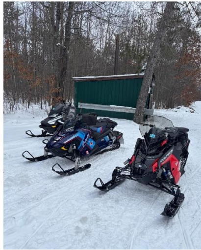
They got the fire going at the warming hut.