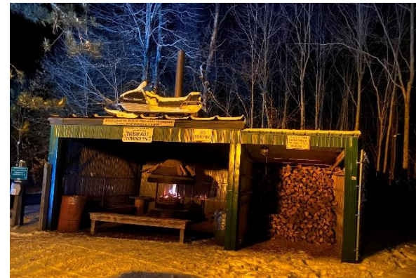
Russ took this AWESOME photo of the warming hut.