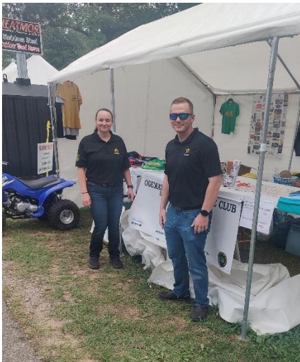
The two previous years at the fair, these two Army recruiters were set up across from us. They got moved down the way this year but they stopped by to say HI.