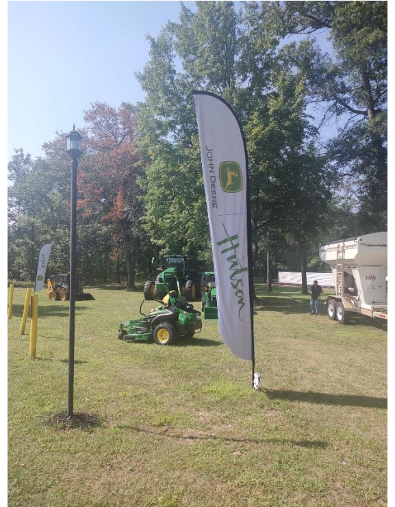
Several of our Club and Golf Outing sponsors were set up near us: Hutson, St. Helen Power Sports, and Willards Equipment.