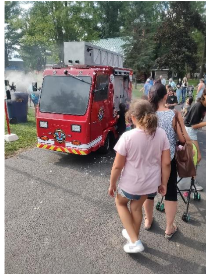
There was an ice-making truck at the fair this year. Kids manipulated levers on the side to make ice bubbles.