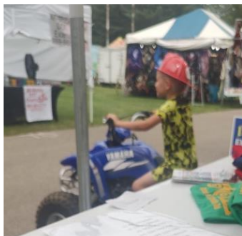
Lots of smiling kids sat on the Arctic Cat and the Yamaha ATV.