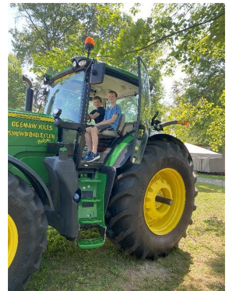
These kids snuck into the trailer.