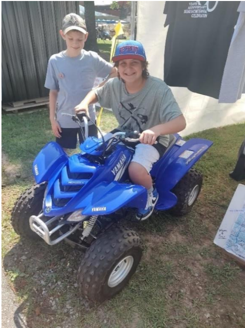
He REALLY wants to win this ATV. Kids climbed on the ATV and sled every day. Parents took pictures for memories.