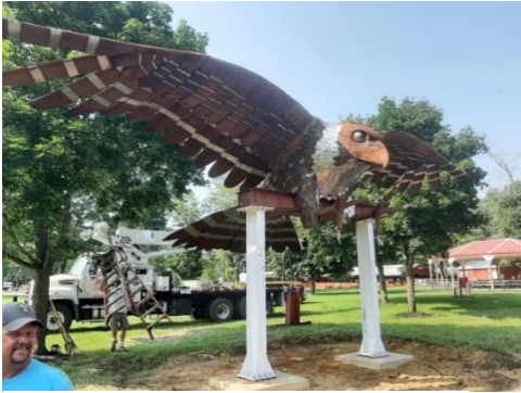
A large metal eagle sculpture guards the fair entrance.