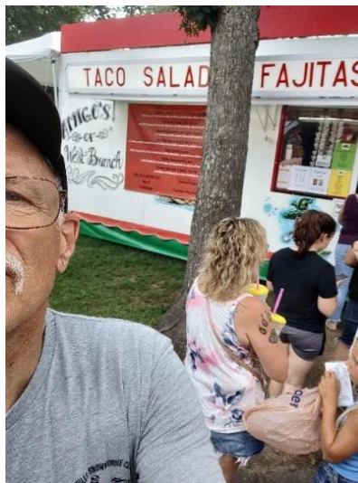
Skip in line at a food truck. BIG burrito for lunch.