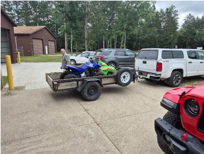
Pat brought the Arctic Cat and the ATV back on his trailer.

Sunday morning the guys took down the canopy, packed it up and brought it all back to the clubhouse. All the toys are put away. Chris was in the clubhouse dealing with the club gear we brought back.