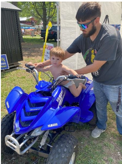
He'll be ready to ride this if he wins.