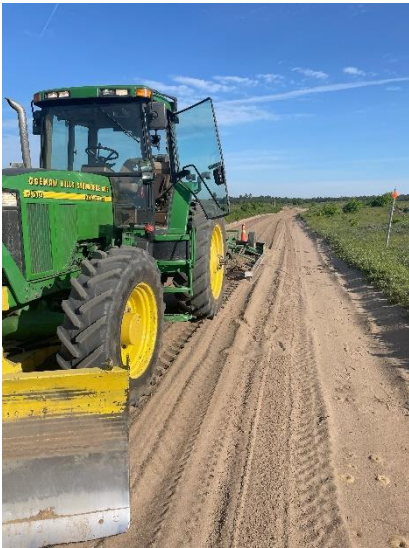
Dan White has been working on our 2nd grade. Terry Black was out the day before this.