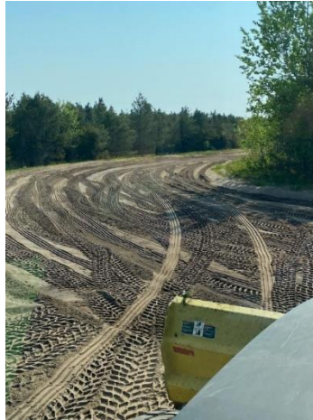
The trail looks a WHOLE LOT BETTER after Russ got through.