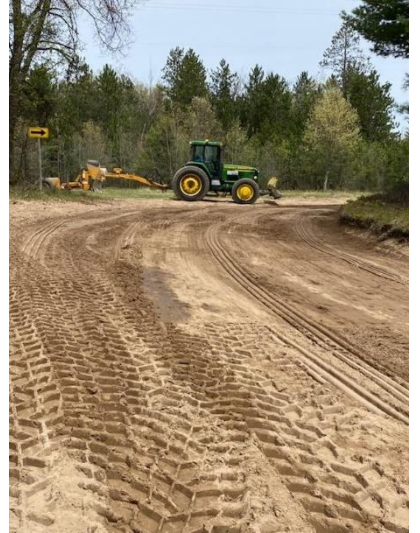
The grader does a pretty good job leveling things.