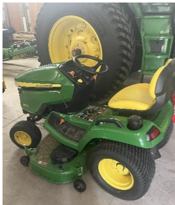
We recently purchased this John Deere X570 mower with a snowblower attachment.