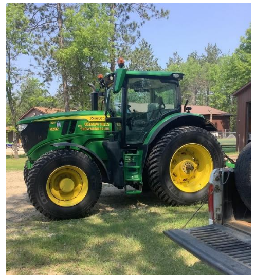
Carl Brooks came by the clubhouse one day and saw the tractor out.