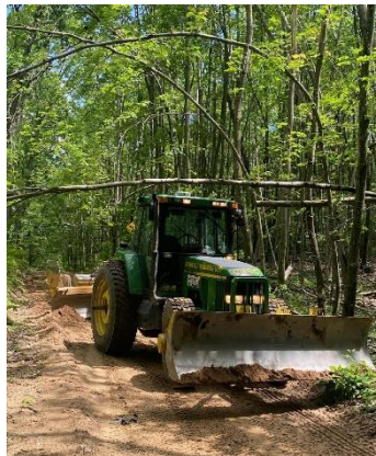
Russ worked on Trail 6 east in the hills before McGregor Rd. The bent branches were close. He had to cut it down to get through.