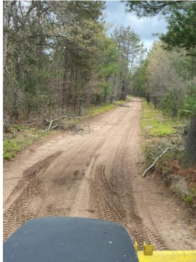
Russ had to push brush off Trail 9 in several spots in order to grade it.