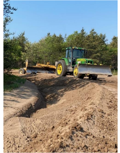
Russ had a terrible time grading out these corners east of the game refuge.