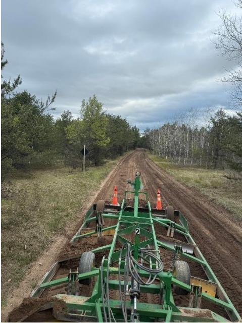
Jeff worked east.