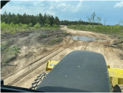
Russ found a water hole south of the game refuge.