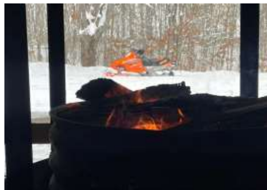
Pat Daly's orange sled plus sled and fire