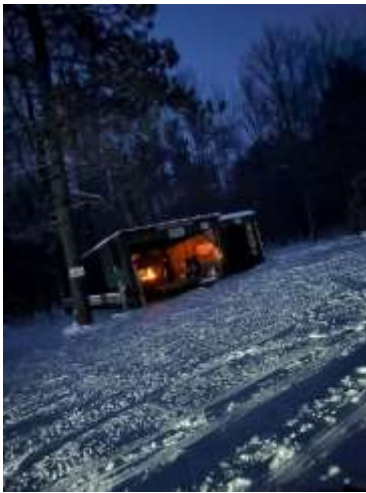
FB friend Tammy Hysell took a cool shot of the hut.