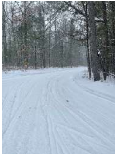
Lyle found Smooth trails