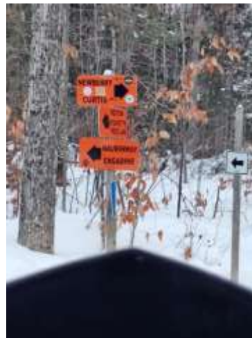
Skip couldn't decide which way to go outside Newberry: All the trails were snowed out.