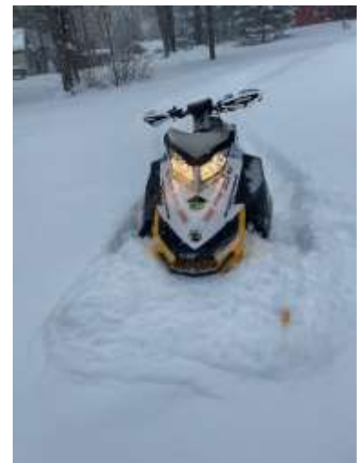
Lyle's sled doing a snow dive.