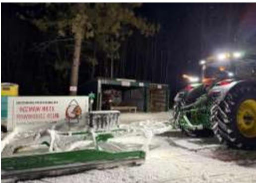
Jeff stopped by the hut one night.