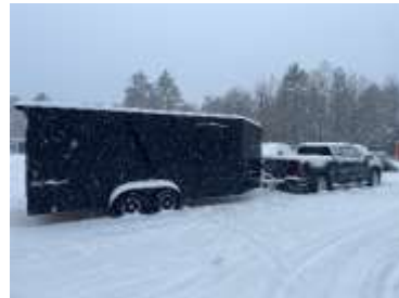
Lyle's trailer is full of snow