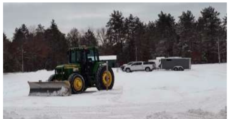
Greg was moving tractors around so it won't be hard to get them out for the Open House. Three tractors and drags makes it crowded. And the new drag is due in next week.