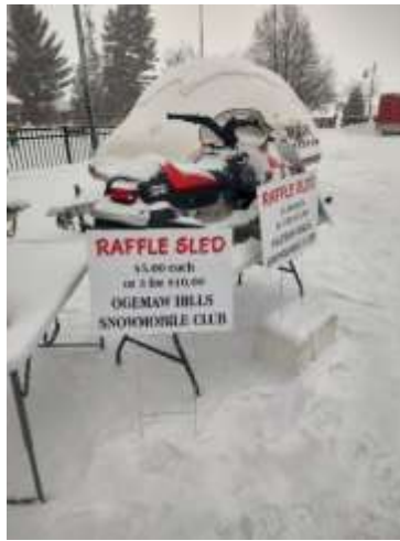
Lots of snow at Fast Eddies but few people.