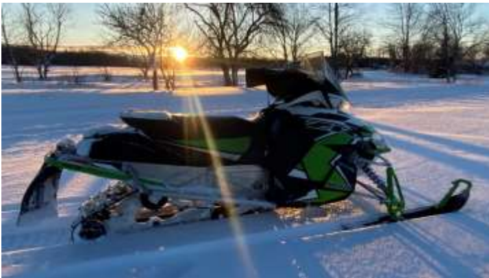
Owen's school bus.