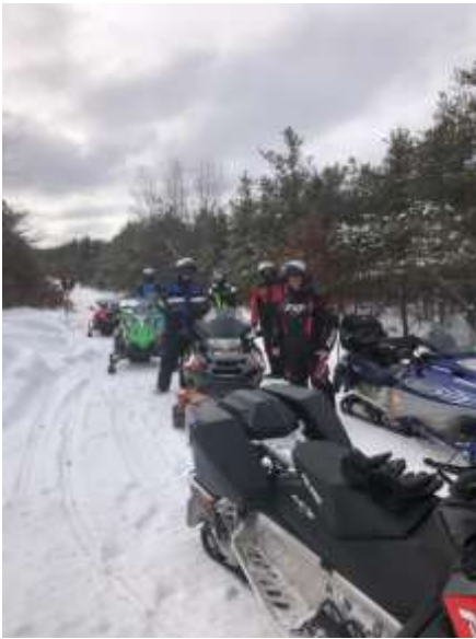
Two Steves , Two Pats, Tom and Walt on a round trip ride from Lupton to Mackinaw City and back in two days ! 370+ miles of groomed trails and perfect weather for the ride! Great time had by all!