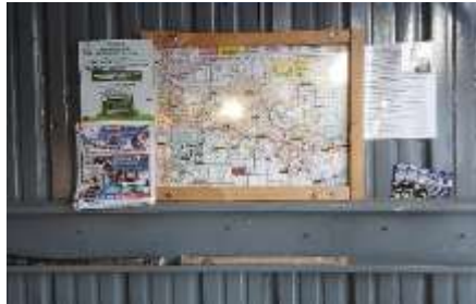
The trail map has been replaced in the warming shack. Frame allows hanging flyers. We just have to keep graffiti, ads of it.