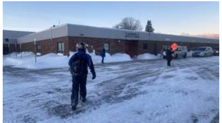
What a way to go to school.