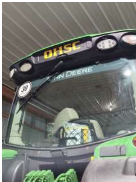
The R2 got stickered.