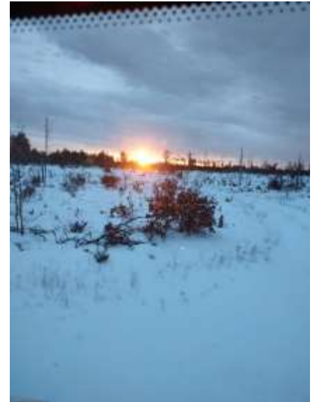
Sunset over a clear cut on east Trail 6.