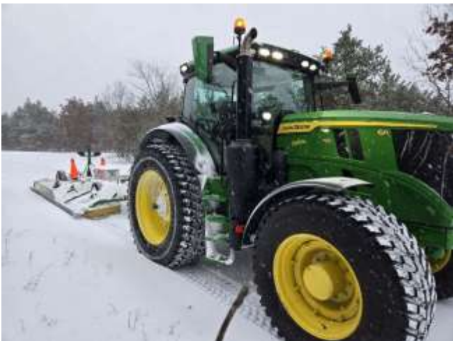
Don Klingler was out one night in the R2.