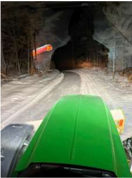
Taking a photo through the window makes an eerie shadow.