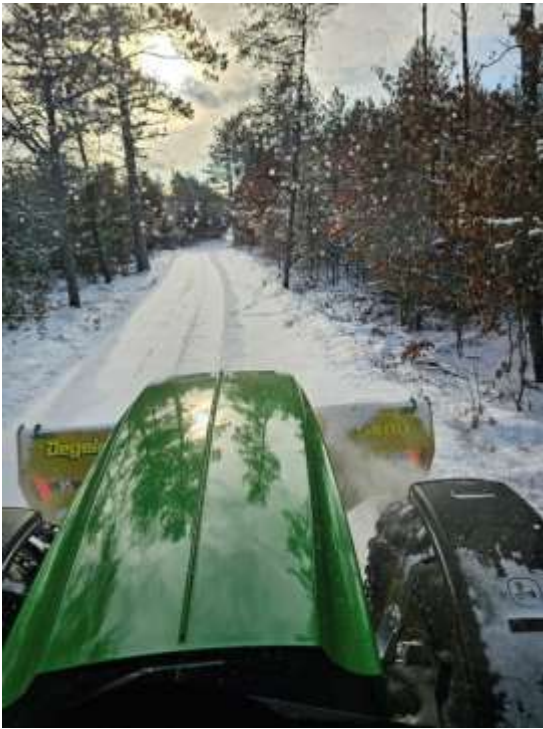
What a great sight! Corey pulling a drag heading east on Trail 6 on January 12. See a January 18 photo of the SNIRT below.. UUggghh.