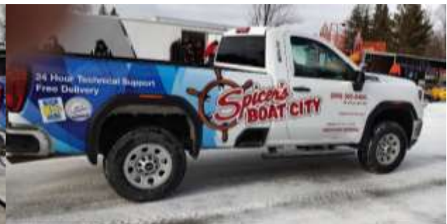
It was nice to see one of our club sponsors, Spicer's Boat City, in the parade.