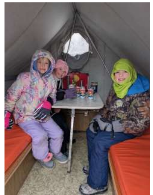
Kids said they would like to stay and fish in it.