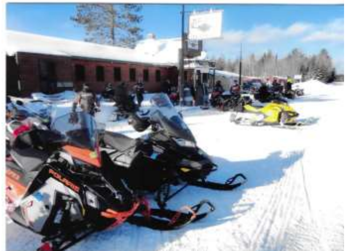
Denny saw 10 sleds waiting for fuel and 30 already eating inside at 1:30 pm at Pine Stump Junction Jan. 8

Make sure you send in YOUR ride or activity photos