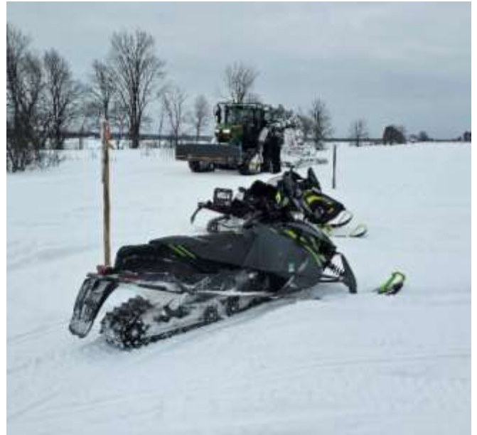
Skip stopped the groomer near the Jordan Valley trails.