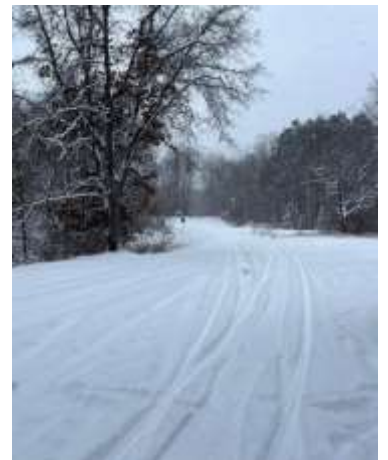
Chris and Chavon Nihls rode our trails before the groomers hit them. The stopped at the warming hut and rode to Clear Lake and back.