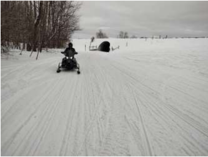
Corey and Skip rode through the tunnel coming down Trail 7 by Gaylord.