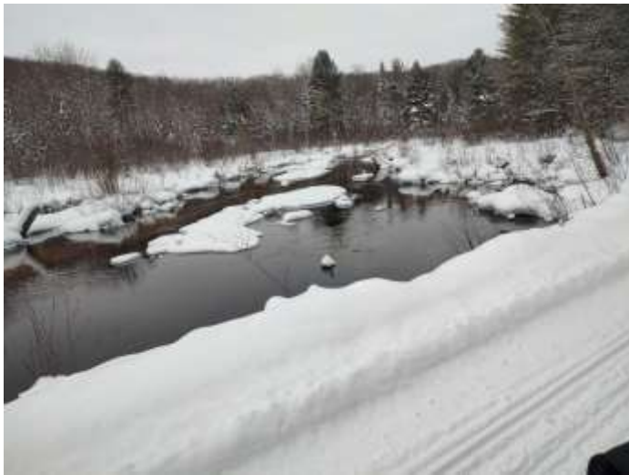
The river was partially frozen in the Jordan Valley.