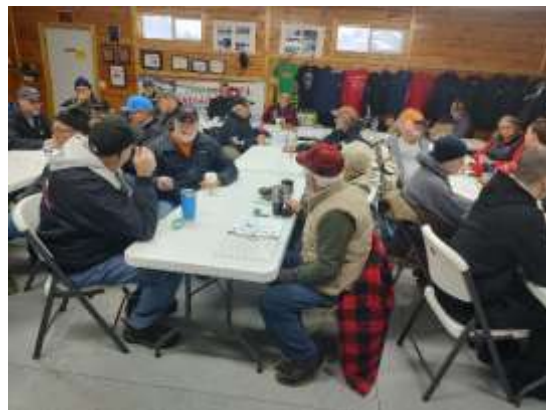
40? members attended the January Club meeting