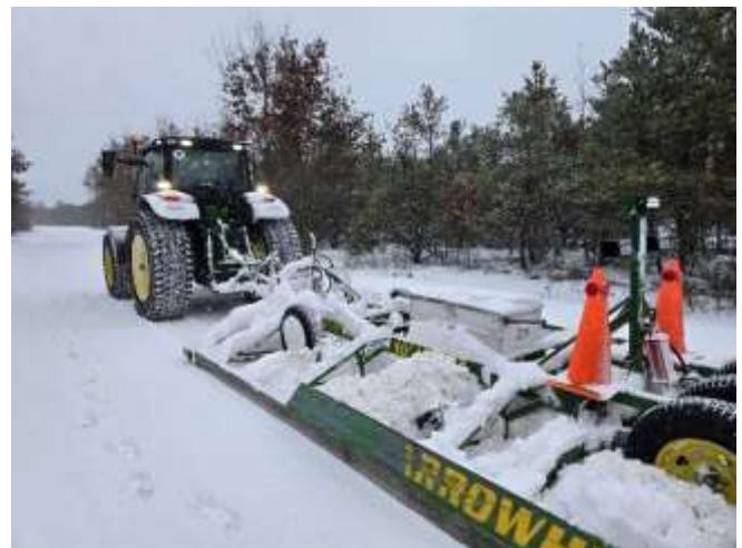
The groomer guys were out several nights the last week of January.