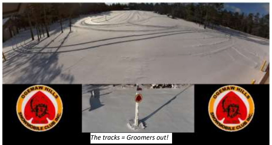
The tracks = Groomers out!