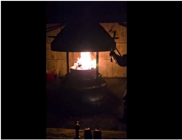
We don't promote this, but someone wanted to post a musical drum solo using our firepit.