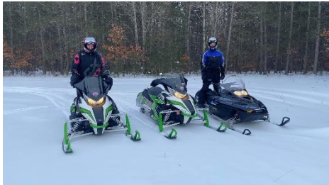
The Theumas took advantage of the snow.