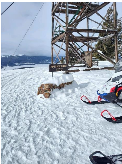
The OHSC crew had a good time out west. It sounds like they want to organize a club trip back there next year.