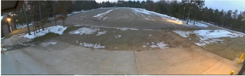
No snow. Need I say more?