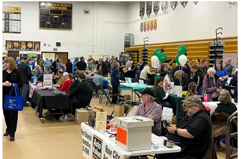
The Business/Community Expo at the high school attracted many people. Our table had raffle tickets and memberships. Good PR.