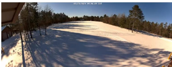
March Madness: March 21 Before / March 23 After