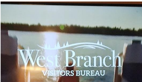
The West Branch Visitors Bureau has been advertising on tv quite a bit.