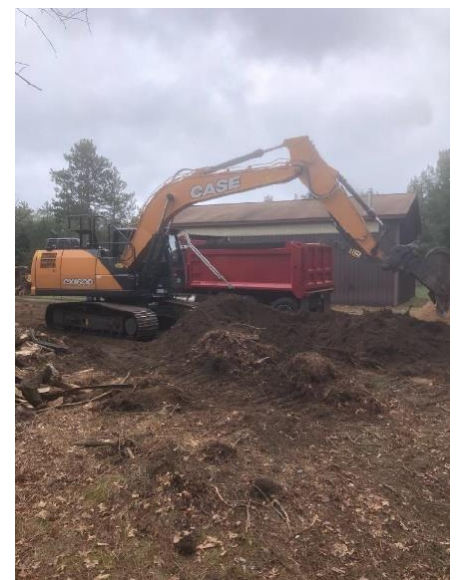
There were a lot of stumps to dig out.