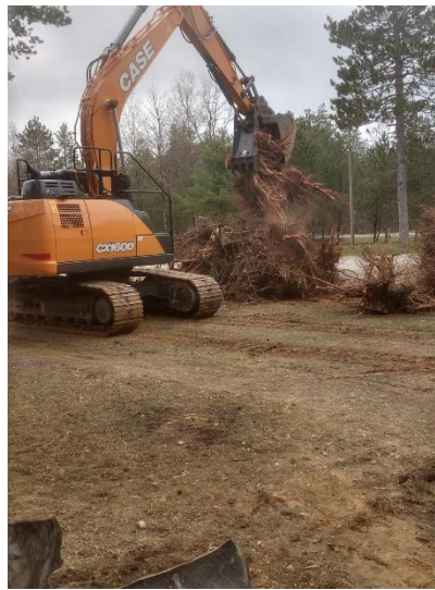
The excavator picked up stumps and loaded into the truck.