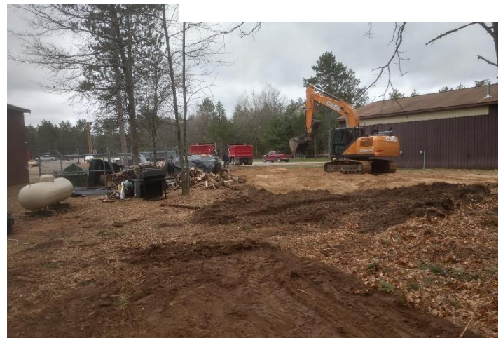
Corey smoothed the sand on the site.