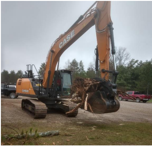
Loading stumps into the trucks.