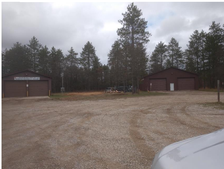
It sure looks different with the trees gone. Will look even more different when the building goes up.