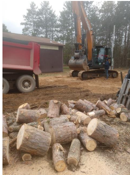
Log pieces waiting to be moved.