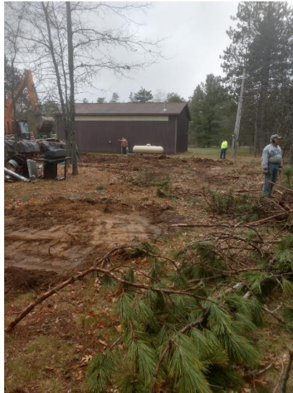
As the brush was cleared, the site takes shape.