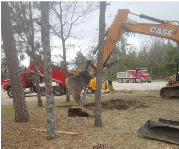
The excavator took down more small pines to make more room for groomers to get through.