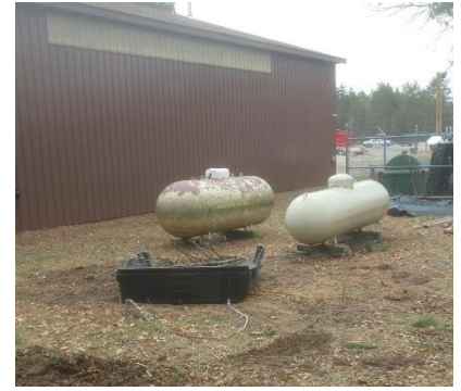
Propane tanks are now together.