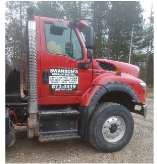
Swanson trucks were all over the site.