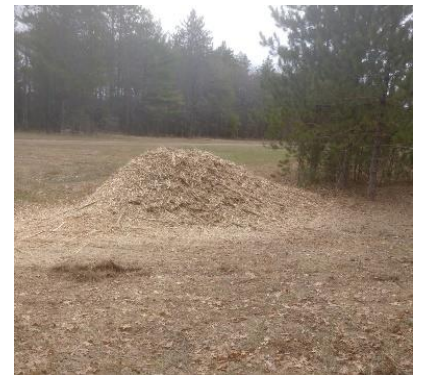
Two piles of chips were left. Denny spread them out.