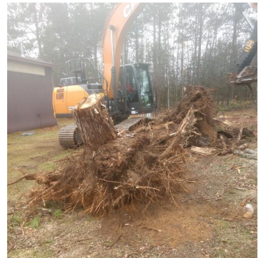
Rick Swanson, who spent all day in the excavator, moved the stumps into a pile to load on trucks later.