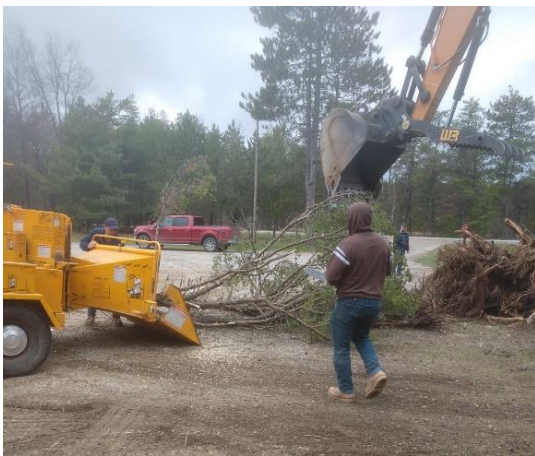
The excavator was able to move piles into the chipper.