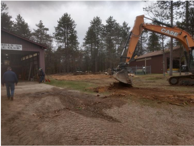
The last of the stumps were moved and the ground leveled.