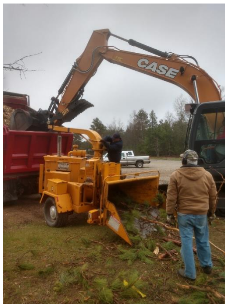
Walt Sammut watched the excavator make room for chips.