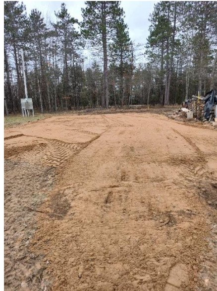
Ready to build.