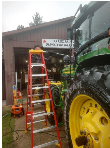
The 7610 got a bath.