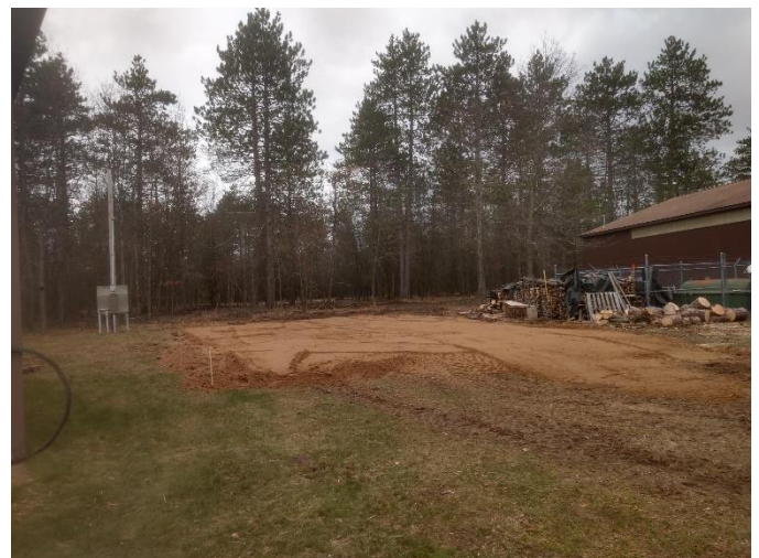
The building site.