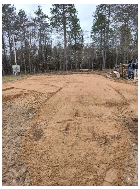
Ready to build.