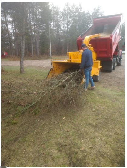
Corey fed branches all day.