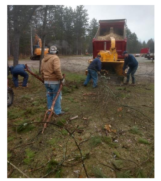
Walt dragged branches all day.