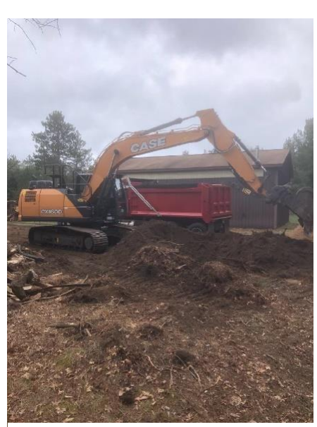
There were a lot of stumps to dig out.