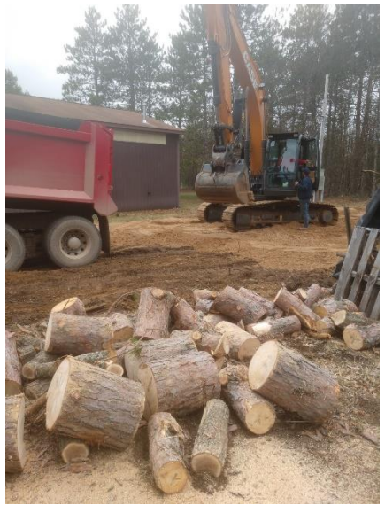
Log pieces waiting to be moved.