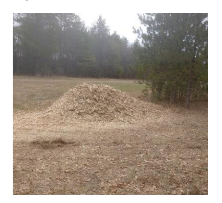
Two piles of chips were left. Denny spread them out.