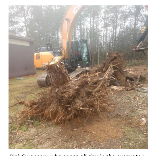
Rick Swanson, who spent all day in the excavator, moved the stumps into a pile to load on trucks later.