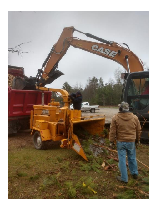
Walt Sammut watched the excavator make room for chips.