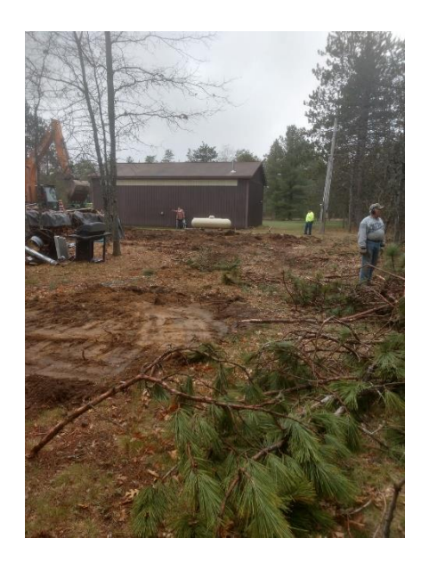
As the brush was cleared, the site takes shape.