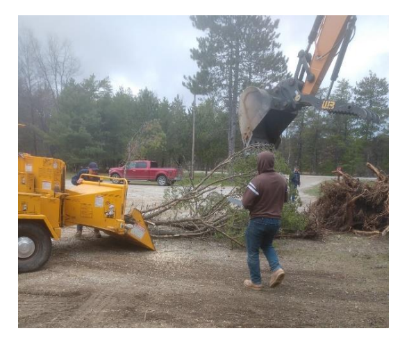
The excavator was able to move piles into the chipper.