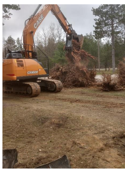
The excavator picked up stumps and loaded into the truck.