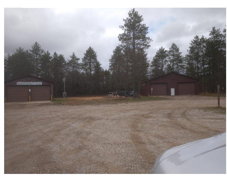
It sure looks different with the trees gone. Will look even more different when the building goes up.