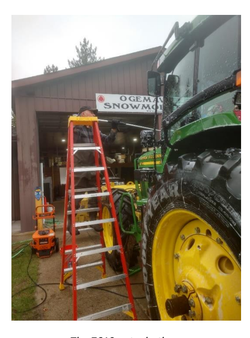
The 7610 got a bath.