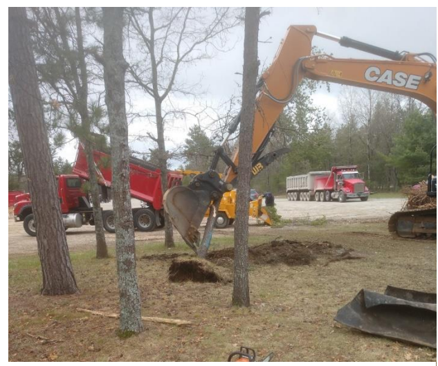
The excavator took down more small pines to make more room for groomers to get through.