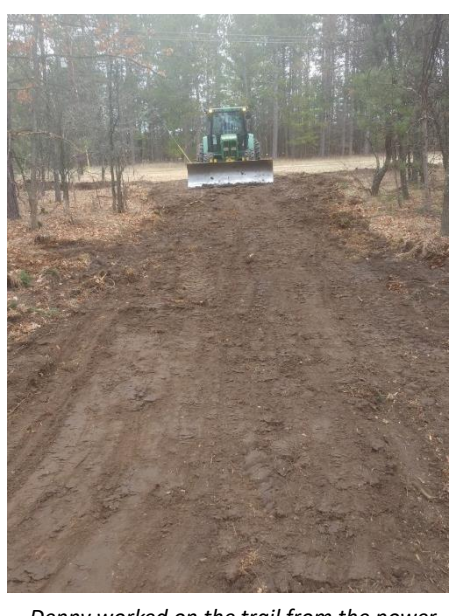
Denny worked on the trail from the power line to the clubhouse area. We defined this trail last year for the Open House / Show. It made it easier to get from parking to the club grounds.