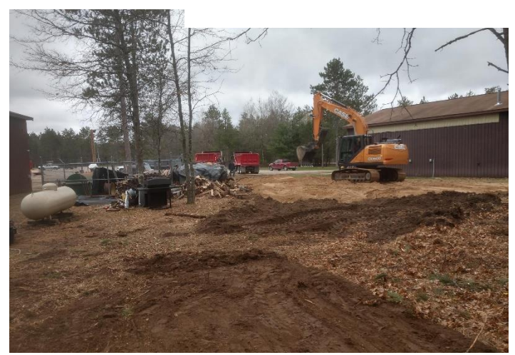
Corey smoothed the sand on the site.