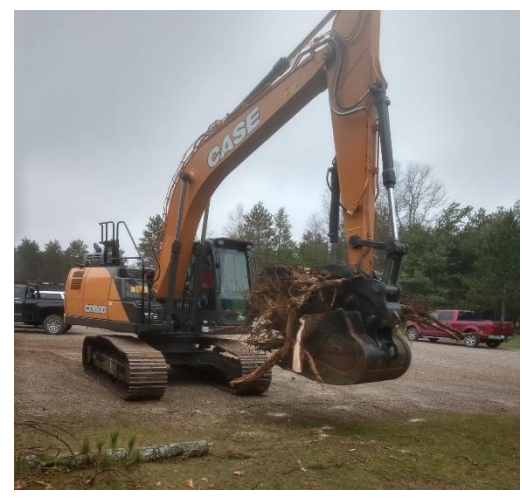
Loading stumps into the trucks.