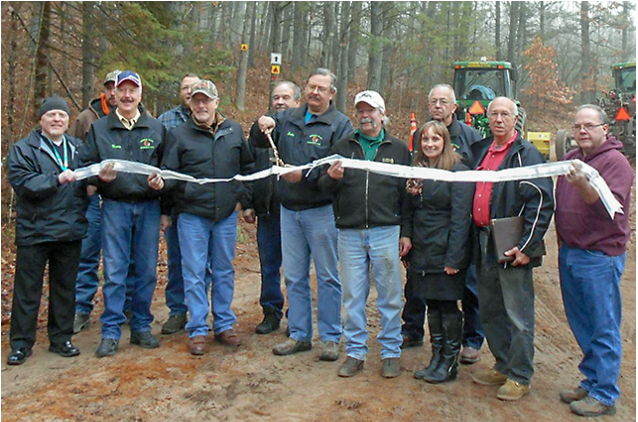
Knoch Rd. Trail ribbon cutting

The ribbon cutting to open the new trail took place on December 8, 2015 which included representatives from the DNR, OHSClub, West Branch Chamber of Commerce, Road Commission and the local media.